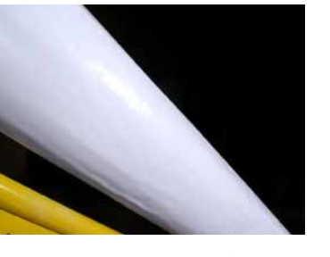
Today, ArmaTuff<sup>®</sup> products offer exceptionally durable alternatives to PVC jacketing or painting.