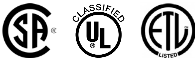
Examples of certification marks used by the CSA Group Testing and Certification Inc., Underwriters Laboratories Inc., and Intertek Testing Services NA Inc. (ITSNA), respectively

Under UL, the listed and labeled designation is facilitated by the terms “UL Listed” and “UL Classified.” A UL listed